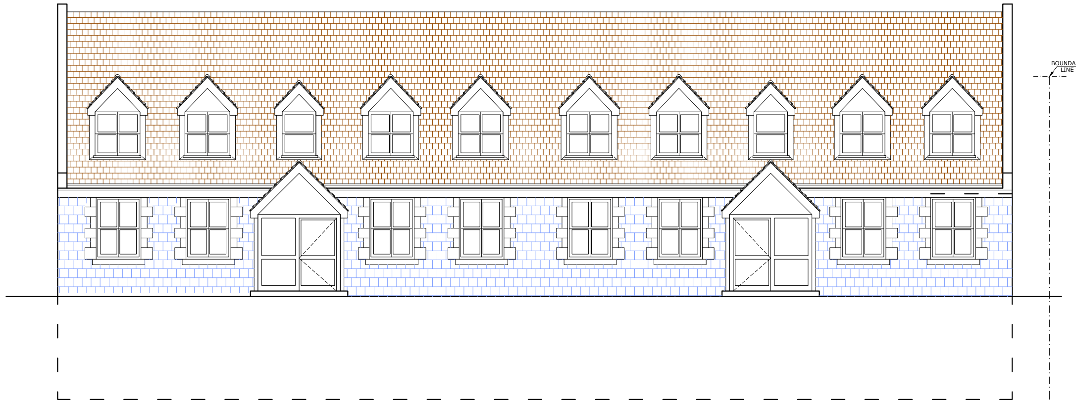
PROPOSED REAR ELEVATION SCALE: 1/100 @A3